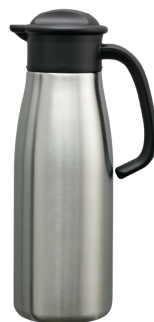
1000NK-N 1 Liter (33.8 oz.) 3.75" X 5.5" X 11" Brushed