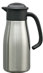
700NK-N 0.7 Liter (23.7 oz.) 3.75" X 5.5" X 9" Brushed